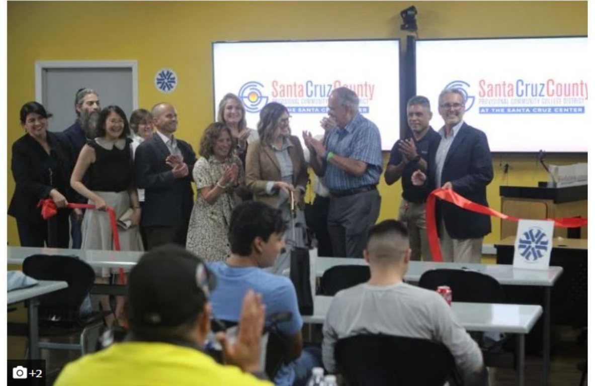
Community college kicks off South32 partnership with electrician course